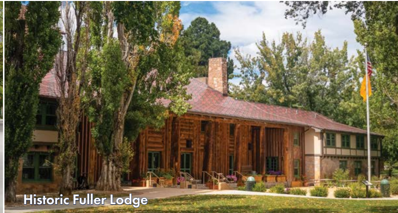
Historic Fuller Lodge