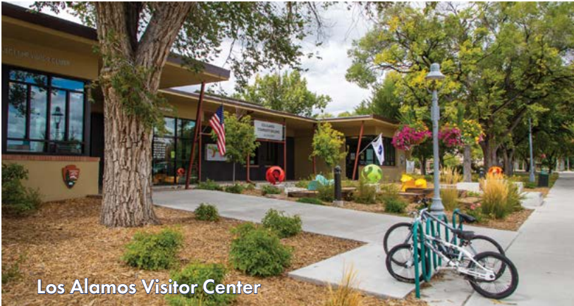
Los Alamos Visitor Center