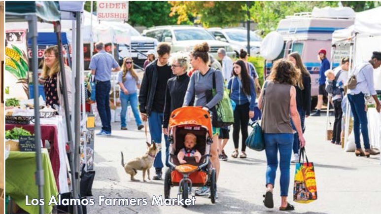
Los Alamos Farmers Market