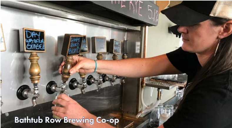
Bathtub Row Brewing Co-op