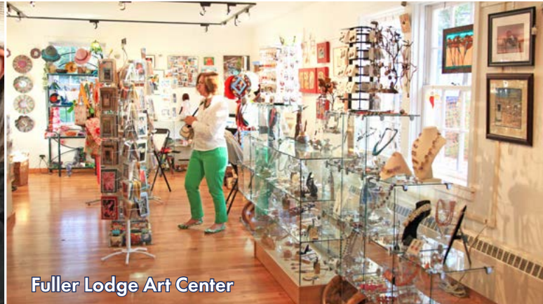
Fuller Lodge Art Center