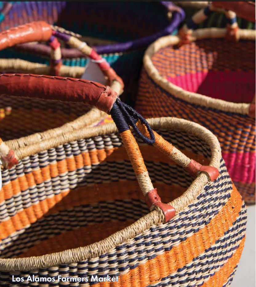
Los Alamos Farmers Market